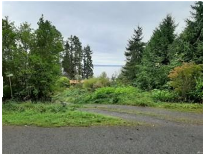
1 / 8 View from N Bay Way... looking over adjacent lo...