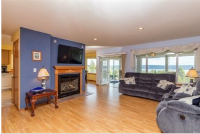
Nice living space. Propane FP and laminate flooring. Very

MLS #: 1447099 Status: Active Price: $445,000 Fin SF: 1,798 Beds: 2 Baths: 2